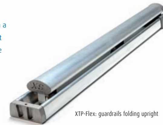
XTP-Flex: guardrails folding upright

Maximum security and minimal impact on a building's architectural design? If you want guardrails to be visible only when they are actually needed, XSPlatforms has the solution: foldable guardrail systems.